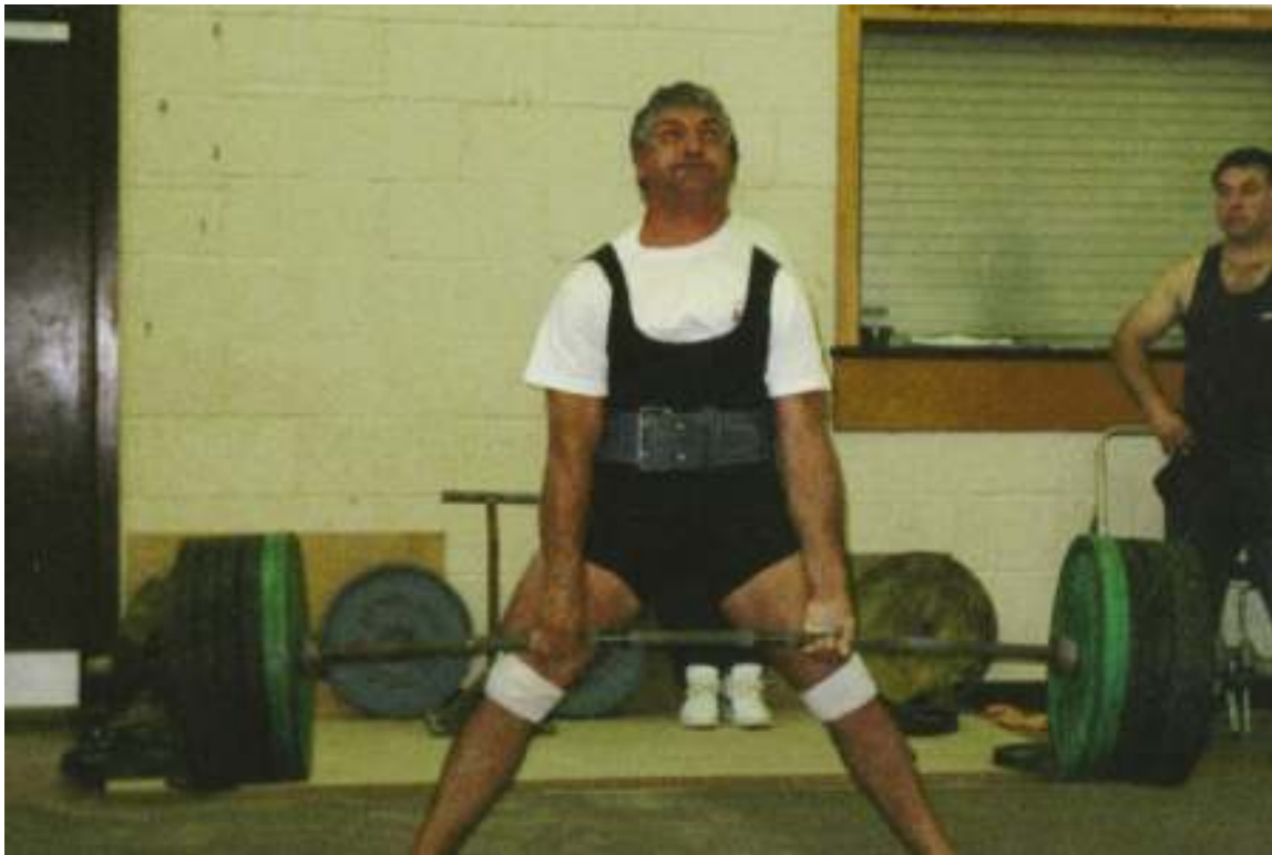
Yardley Gobion WLC 320kg May 1998

Over the years I have also recorded the following lifts in training;